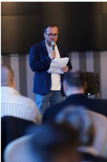
AIDS Conference, 2025

During the reporting period, the Equality Movement participated in a number of workshops and conferences focused on promoting the protection of LGBTQ+ rights. In addition, the organization made a significant contribution to the preparation of reports published by international organizations and networks assessing the human rights situation at the local, regional, and international levels. Notably, these included: